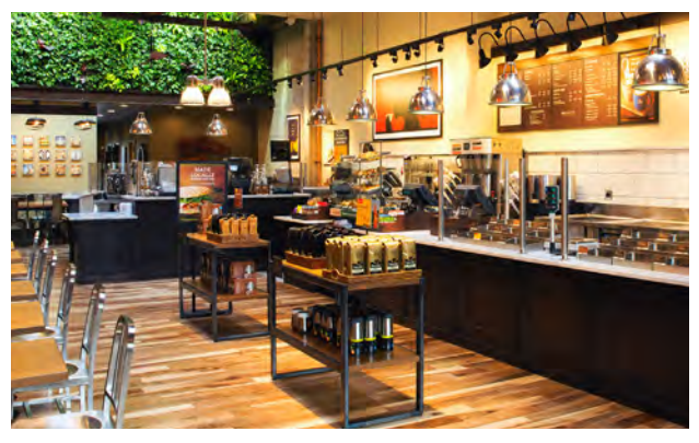
For Peet's Coffee, we printed directly onto reclaimed wood.

Many of our customers design with the environment in mind.