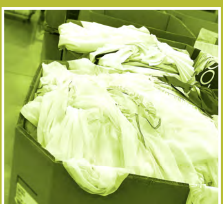
We collect all fabric trimmings and recycle responsibly.