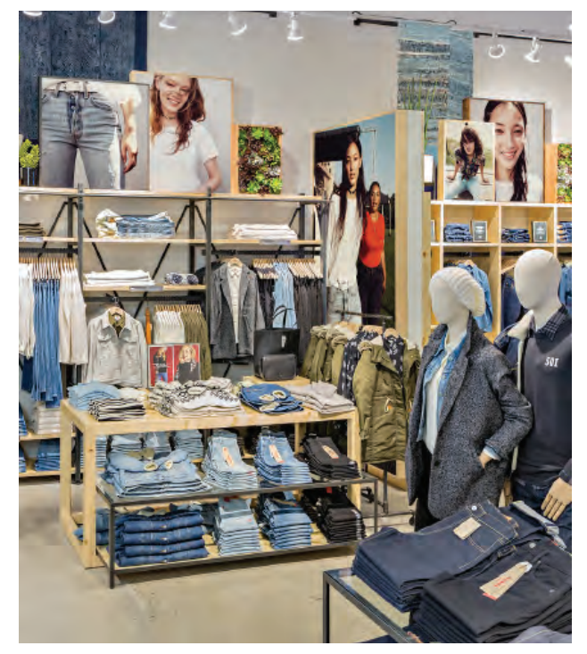
Levi's used recycled content textiles for in-store displays.