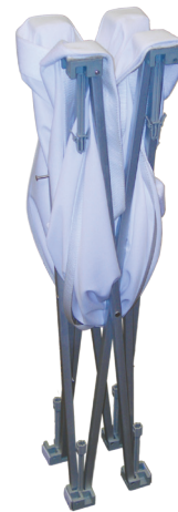
Collapsing Frame & Attached Graphic