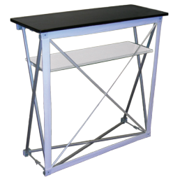
Frame, Counter Top and Storage Shelf